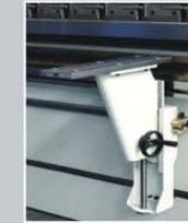
丝杆升降前托料(选配) Screw lift front material holder(Option)