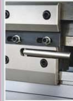
偏心式快夹(选配) Eccentric fast clamp(Option)