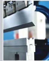
双V下模(选配) Double V die(Option)