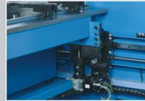
数控后挡料(选配) CNC backgauge(Option)